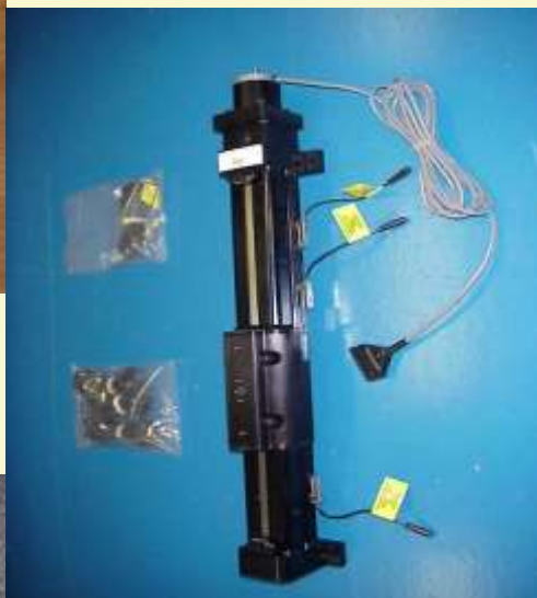
Whether pneumatic or electric actuators, accessories can be mounted and packaged together to make complete assemblies.