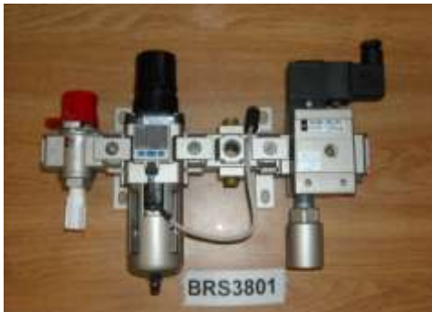
Filter/regulator assembly with lock out valve and shut off valve assembled to specification with customer assigned part number.