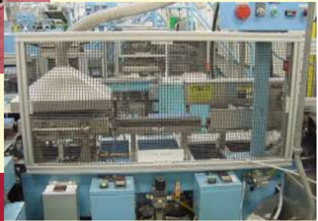
Custom guarding with plastic coated wire grid (above). Custom guard with gas spring assisted hinged lid (below).