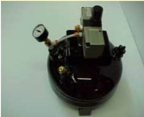
Enclosure with components mounted are ready to use. One part number gets a complete assembly.