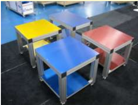
Heavy duty work tables with custom tops (above). Mobile compressor cart with storage area for accessories (below)