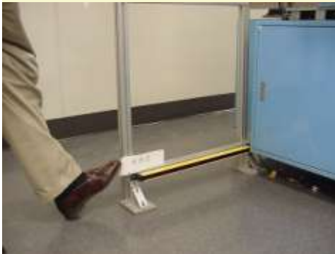
Hard guarding with integrated light curtain installed (above). Door interlock switches installed on machine guard (below)