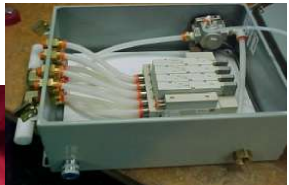
An enclosure with components mounted and plumbed. One part number to order and ready for mounting on the machine.