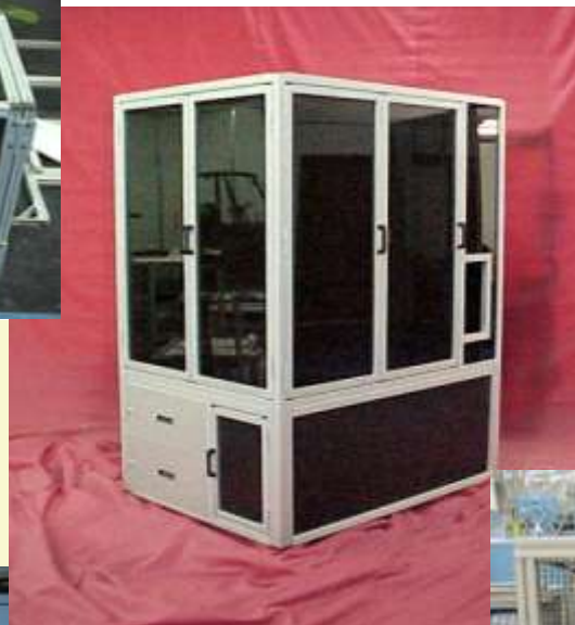
Complete robotic cell guard and machine base complete with door interlocks and safety switches installed