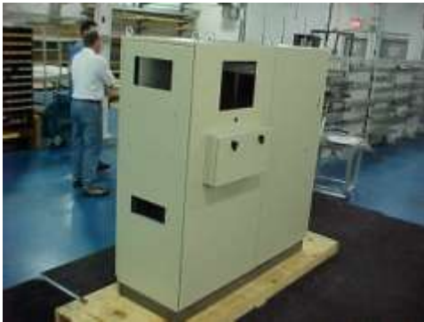
Standard enclosure modified and assembled to customer specifications. Additional components such as air conditioners or filters can be added as necessary.