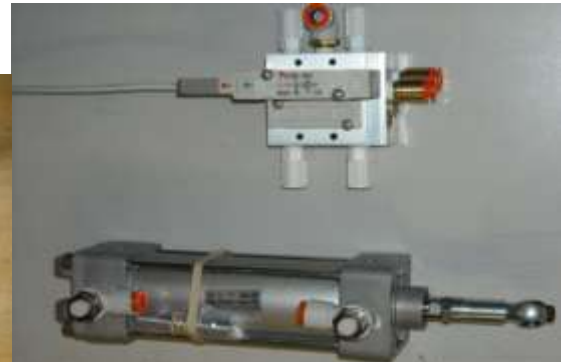
Single part number kit includes a valve manifold with fitting and mufflers installed plus an air cylinder with flow controls and rod end installed .