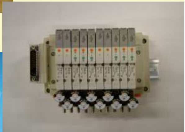
10 station manifold assembly with regulators and gauges (above). Custom valve manifold assembly (below).