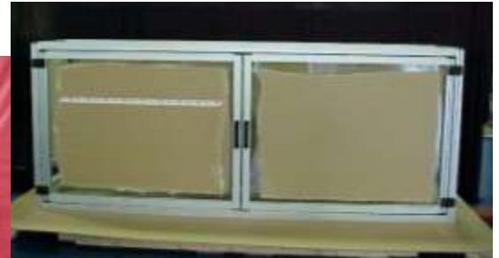
Guard package with hinged doors clear polycarbonate walls