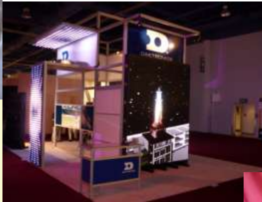
Maytec aluminum extrusion trade show booth design. Benefits included easy assembly and reduced transportation costs.