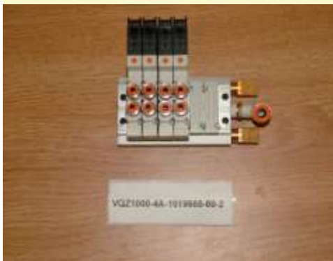
Preassembled manifold with fittings and mufflers (above). Valve manifold with filter/regulator, fittings and blow gun (below)