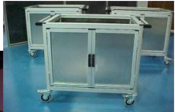
Custom cart with locking casters and stainless panels on hinged doors ready for customer supplied top.