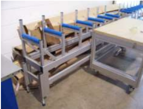
Custom roller structure and heavy duty cart designed and produced to meet the unique specifications for the job