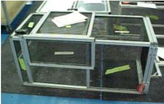
Custom guard structures designed and produced to meet the unique specifications for the job