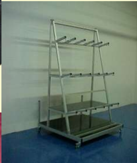
Long goods storage rack with shelves and area for sheet stock on casters