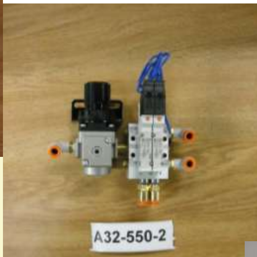
Regulator with 2 station manifold base assembled with push-on fittings installed.